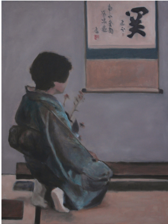
Barrier 2011 oil on canvas 48 x 36 in / 120 x 90 cm