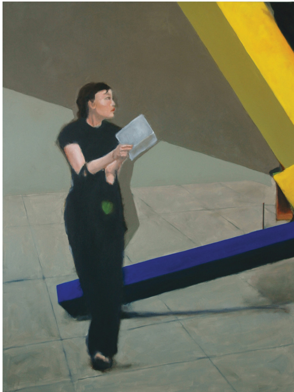
21 Elements 2010 oil on canvas 48 x 36 in / 120 x 90 cm