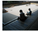
Meditation at Ryoanji 2004 archival pigment Print 8 x 10 in