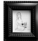
Mother of All of Us 2021 ink on paper 3.5 x 4 in (image) 6 x 6.5 in (frame)