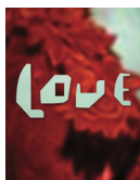
LOVE 2005 digital collage with artist's typeface, eno 25 x 37 in (frame)