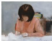
The Lacemaker II (at home) 2011 oil on canvas 16 x 20 in