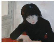
The Lacemaker I (at the Louvre) 2011 oil on canvas 16 x 20 in